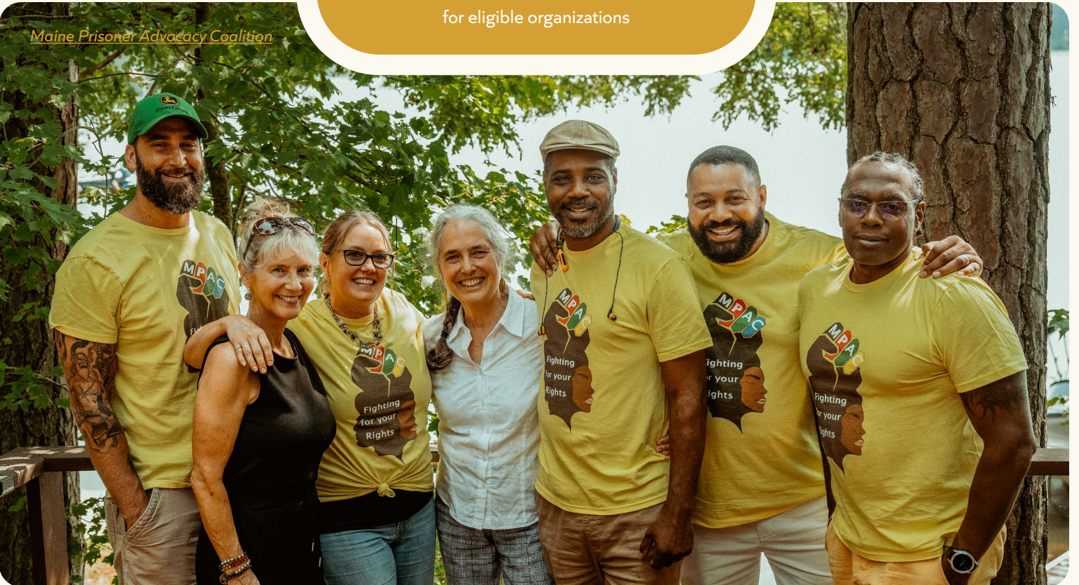
Maine Prisoner Advocacy Coalition