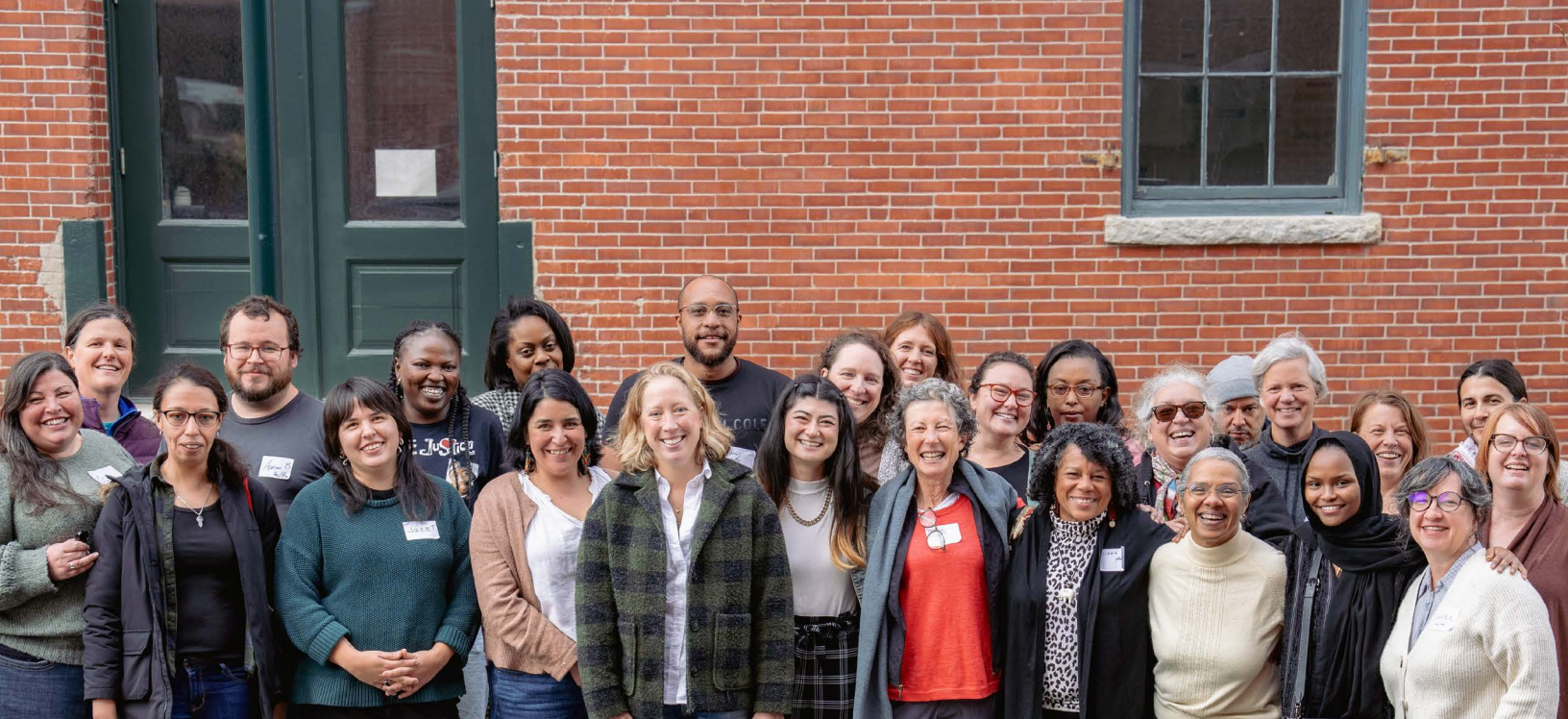
The 2023 Grants for Change Grantmaking Advisory Committee.