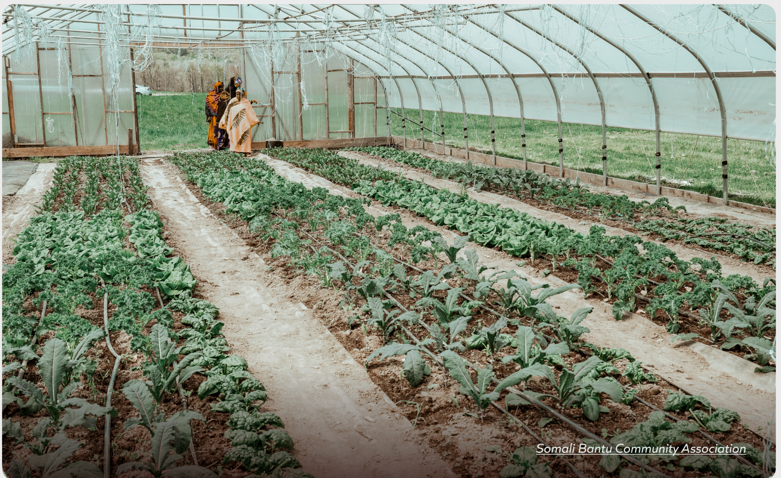
Somali Bantu Community Association

5. Grant Selection and Announcement: Final decisions about the Immigrant-Led Organizations Fund grantee recipients will be made by the Grantmaking Advisory Committee (with approval by the Maine Initiatives Board of Directors) and announced by Maine Initiatives in August of 2025.